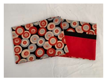
Pillowcases (Set of 2) Standard-sized pillowcases in assorted designs. $15