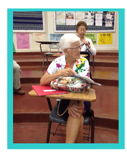
2012 Services at Kailua High School's music room, during temple construction