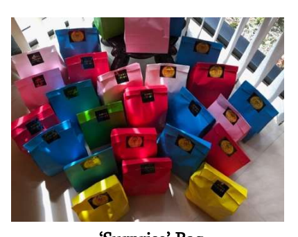
'Surprise' Bag The contents are worth more than the purchase price. $5