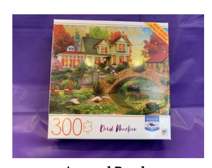
Assorted Puzzles Sizes ranging from 300 to 1,000 pieces. Starting from $5