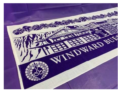
WBT Bon Dance Towel Cotton fabric towel made in Japan. 33 by 14 inches. $5