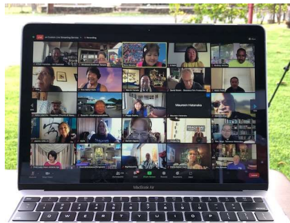
Connecting with temples & churches (inter-denominational) in Hawaii and internationally via Zoom!