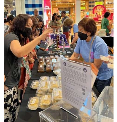
A dedicated "Andagi Line" with a monitor and stanchions, helped keep things in control this year.